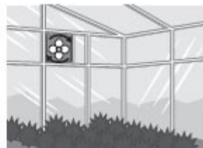
Air conditioning control